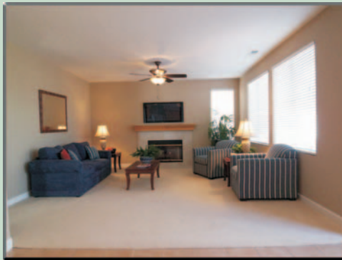
Family Room and Kitchen Flow From One to the Other