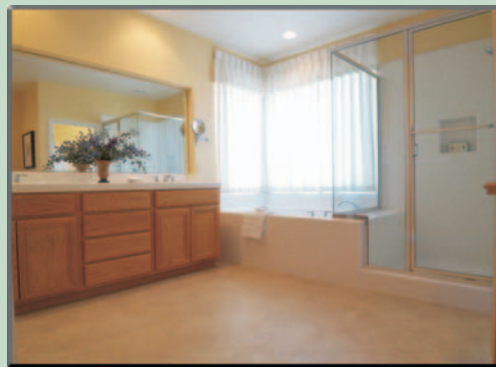
Master Bath w/ Jacuzzi Tub