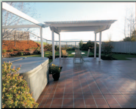
Patio With A View

Features: Large light /bright Great Room that combines gourmet kitchen and family room, formal dining room and breakfast area, two master suites, recessed lighting, gas log fireplace, custom light fixtures, high windows for lots of natural light. Easy access to I-580 and I-680 yet located in peaceful & quiet hills overlooking Dublin and Pleasanton.