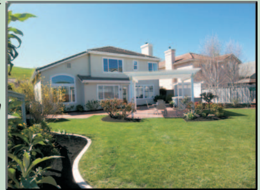
Large Flat Backyard

Features: Large light /bright Great Room that combines gourmet kitchen and family room, formal dining room and breakfast area, two master suites, recessed lighting, gas log fireplace, custom light fixtures, high windows for lots of natural light. Easy access to I-580 and I-680 yet located in peaceful & quiet hills overlooking Dublin and Pleasanton.