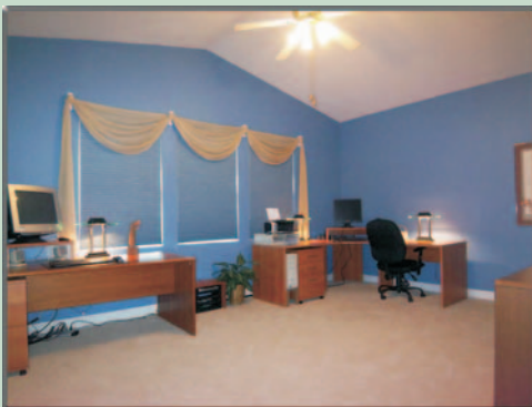
Huge Bonus Room