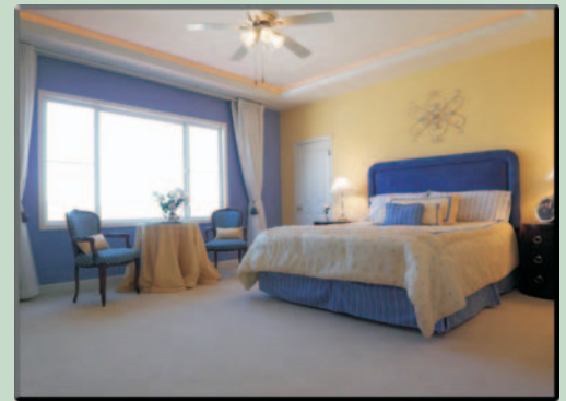
Upstairs Master Suite

More Photos & Virtual Tour at www.HarperMees.com