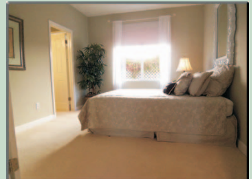
Downstairs Master Suite